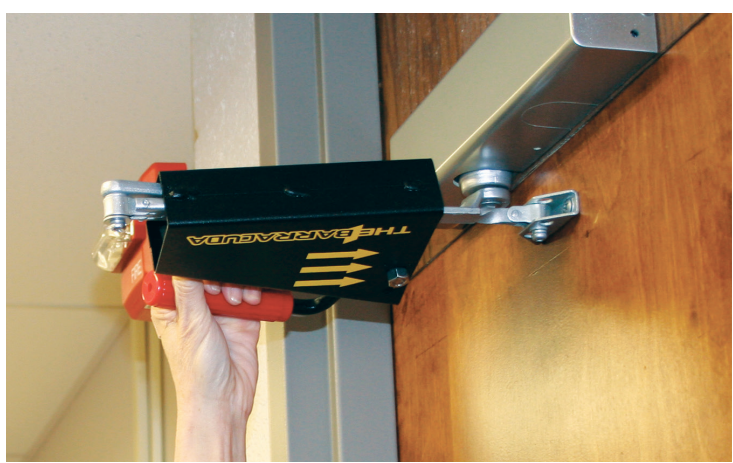
Due to the wide variety and inconsistency of door closers and their fasteners, it is not recommended to use the DCS as a standalone solution.